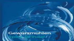
Gewürzmühlen Spice Grinders