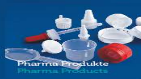
Pharma Produkte Pharma Products