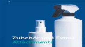
Zubehör und Extras Attachments